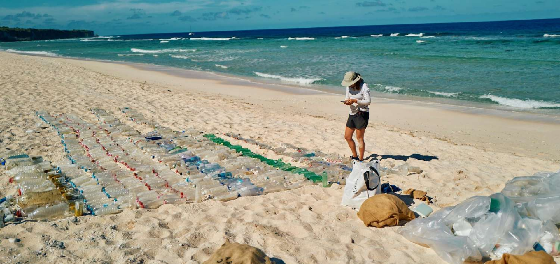
The scientific team collects data on waste washed up on the island