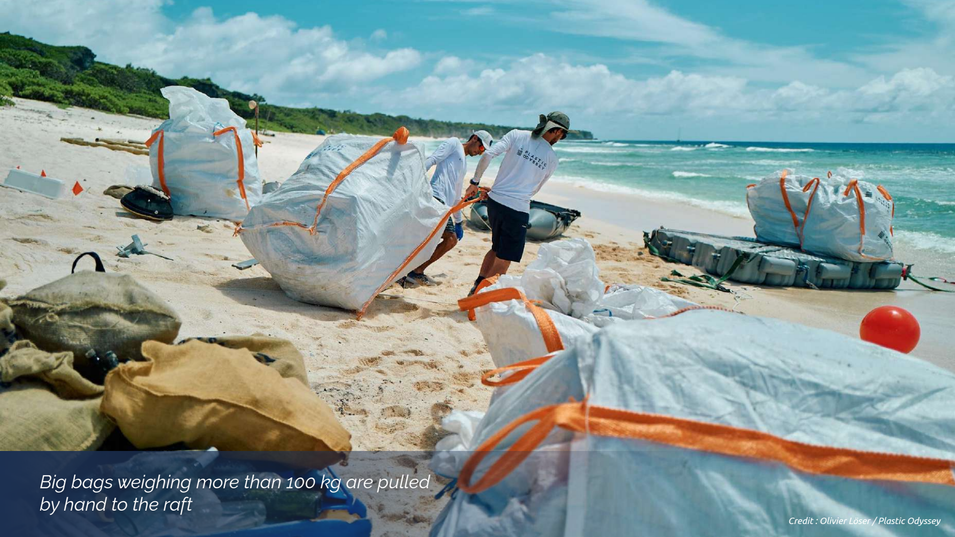
Big bags weighing more than 100 kg are pulled by hand to the raft