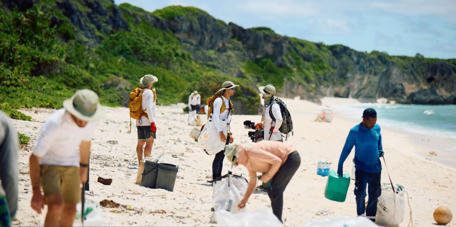
Plastic Odyssey team cleans up Henderson Island's east beach