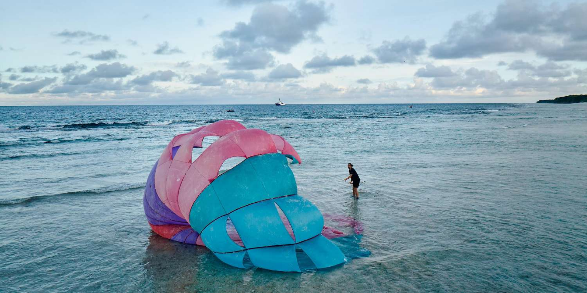
First tests of using parasailing to extract waste from the island