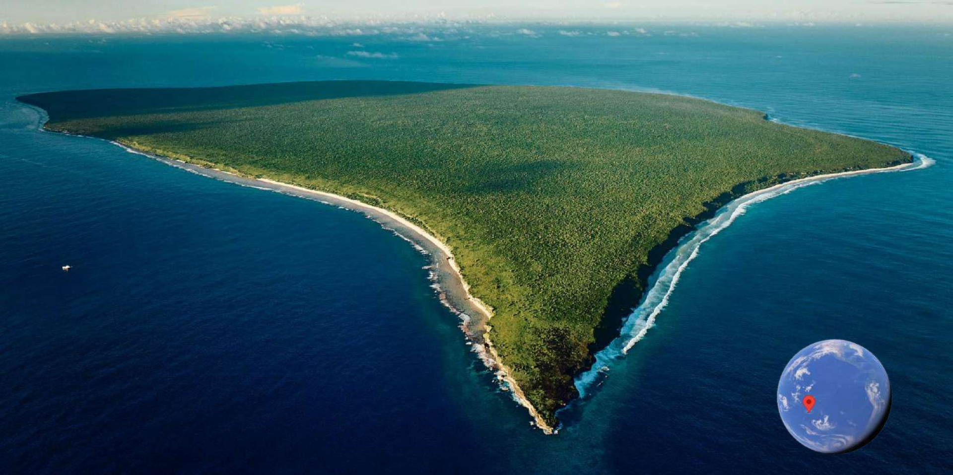
The uninhabited island, Henderson (Pitcairn Islands, South Pacific)