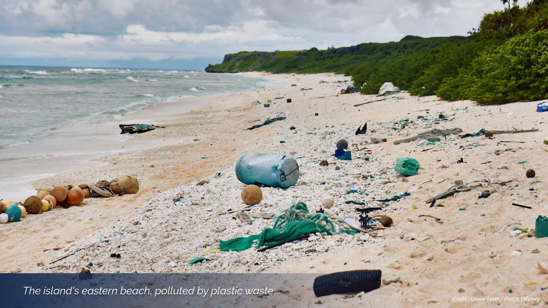
The island's eastern beach, polluted by plastic waste